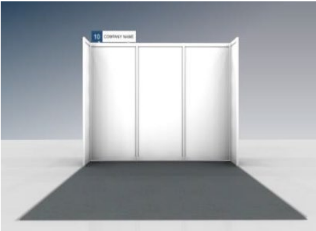
Example: 9 sqm shell scheme exhibition stand